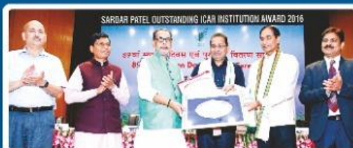
Sardar Patel Outstanding ICAR Institution Award 2016 conferred to CCSHAU