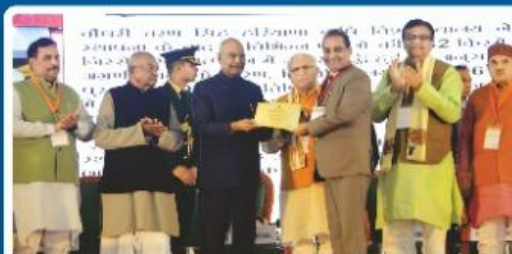
University has received Haryana Kisan Ratna Award-2019.

As per the availability of rooms in farmers' hostel at university rate.