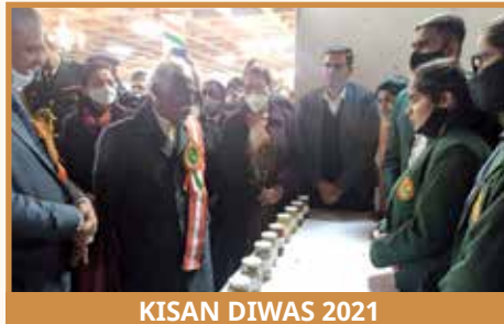
KISAN DIWAS 2021

I. Residential Area for Staff and Faculty: There is accommodation facility for the staff and faculty members in the campus. There are a total 77 houses of different types including 9- type (1), 10 types (12), 11-type (14), 12-type (32) and 14-type (18).