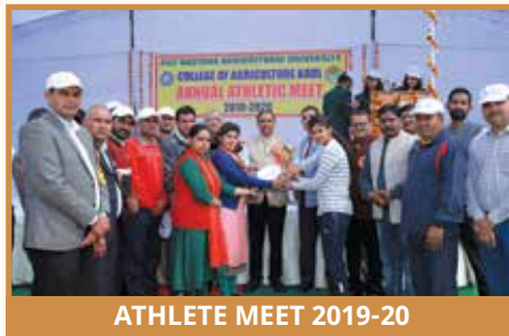
ATHLETE MEET 2019-20

J. Dairy Unit: The College has one dairy unit which is having sixteen animals out of which four are milking buffaloes, one drought buffalo, one bull and ten calves.