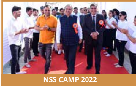
NSS CAMP 2022

H. Laboratories: In the college building, there are seven well equipped laboratories, one each for Horticulture, Agronomy, Plant Pathology, LPM, Soils, Biochemistry, Engineering and Entomology to carry out different practicals related to their subjects for the students.