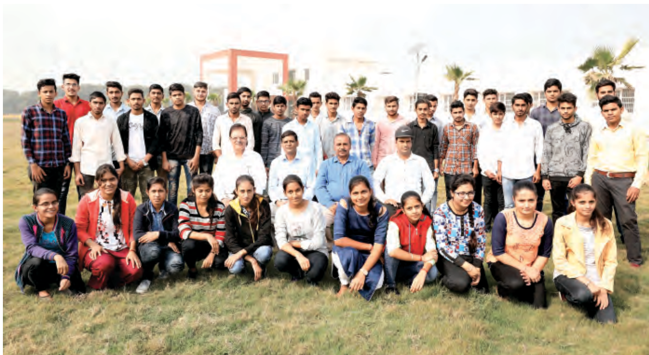
Students of COA Bawal with Principal and other faculty during a training programme

In the event of any inconsistency amongst the rules or in the event of any clarification with respect of the above rules the matter shall be decided in accordance with UGC Regulations on Curbing the Menace of Ragging in Higher Educational Institutions, 2009 and Directions of the Hon'ble Apex Court regarding Prevention of Ragging with the approval of the Vice-Chancellor.