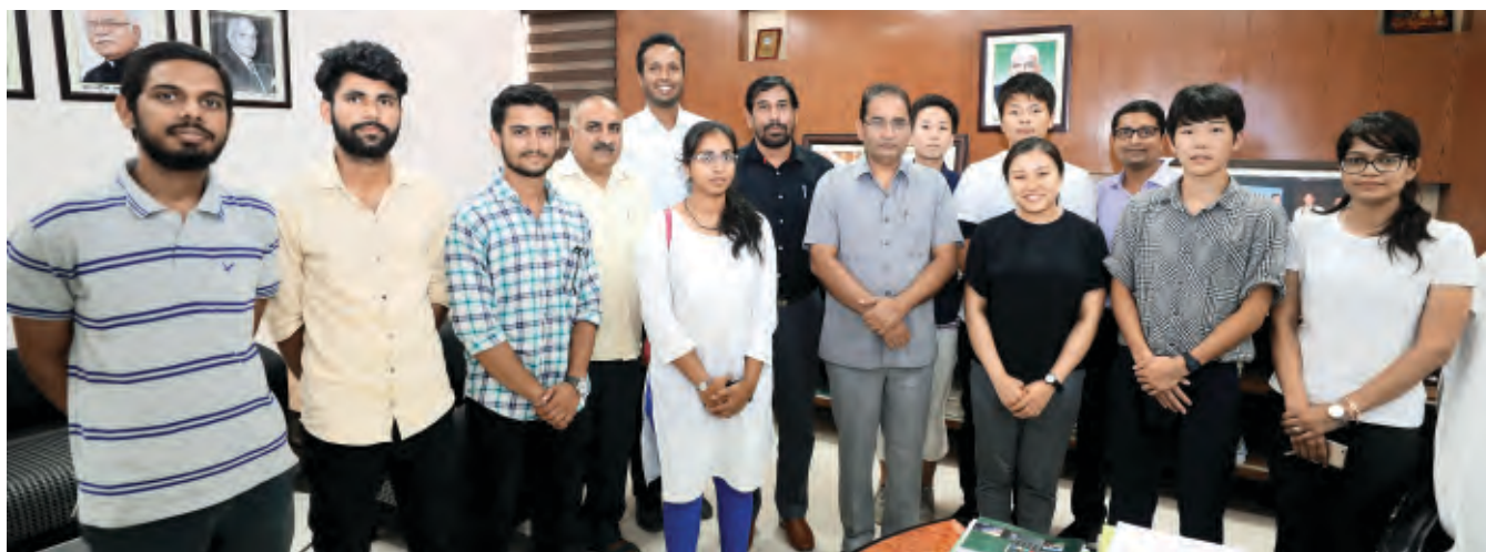
Visit of students and faculty of Tokyo University of Agriculture