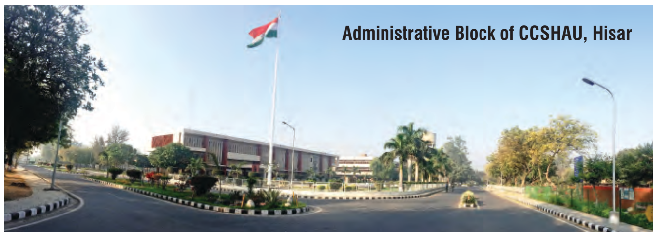
Administrative Block of CCSHAU, Hisar