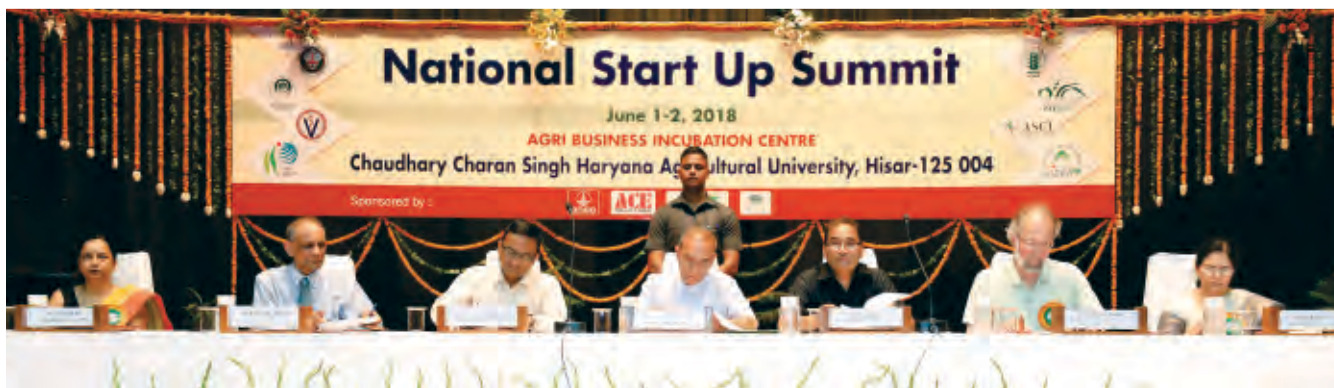
National Start Up Summit-Agribusiness Incubation Centre