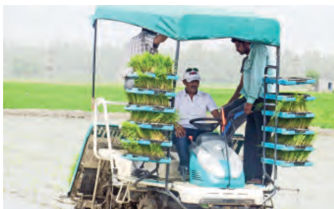
Self-propelled six row paddy transplanter being operated in the puddled field