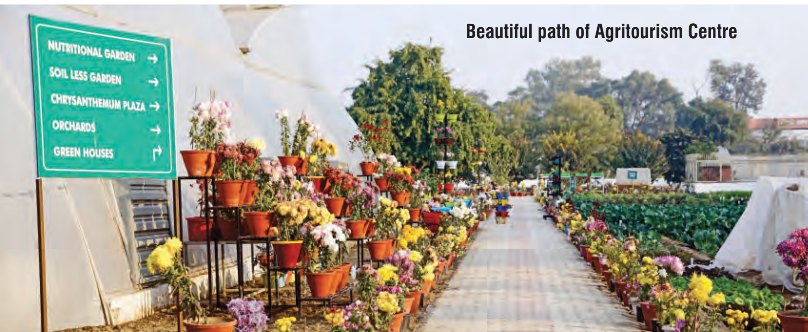
Beautiful path of Agritourism Centre

The Prospectus gives only general information about the various Constituent Colleges and programmes offered. Detailed rules on all aspects are available in the University Calendar Vol. II and instructions issued from time to time.