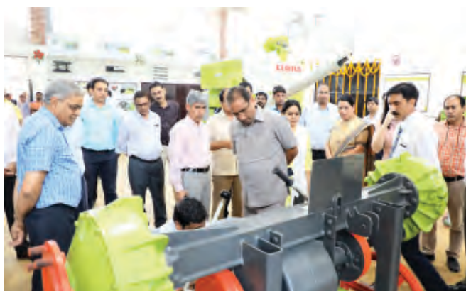
Officers of University visiting Combine Harvesting Technology Training Lab