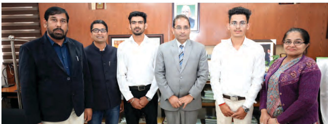
Full time scholarship awarded to two students from CCSHAU to visit Tokyo University of Agriculture