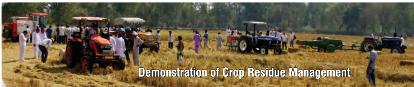
Demonstration of Crop Residue Management