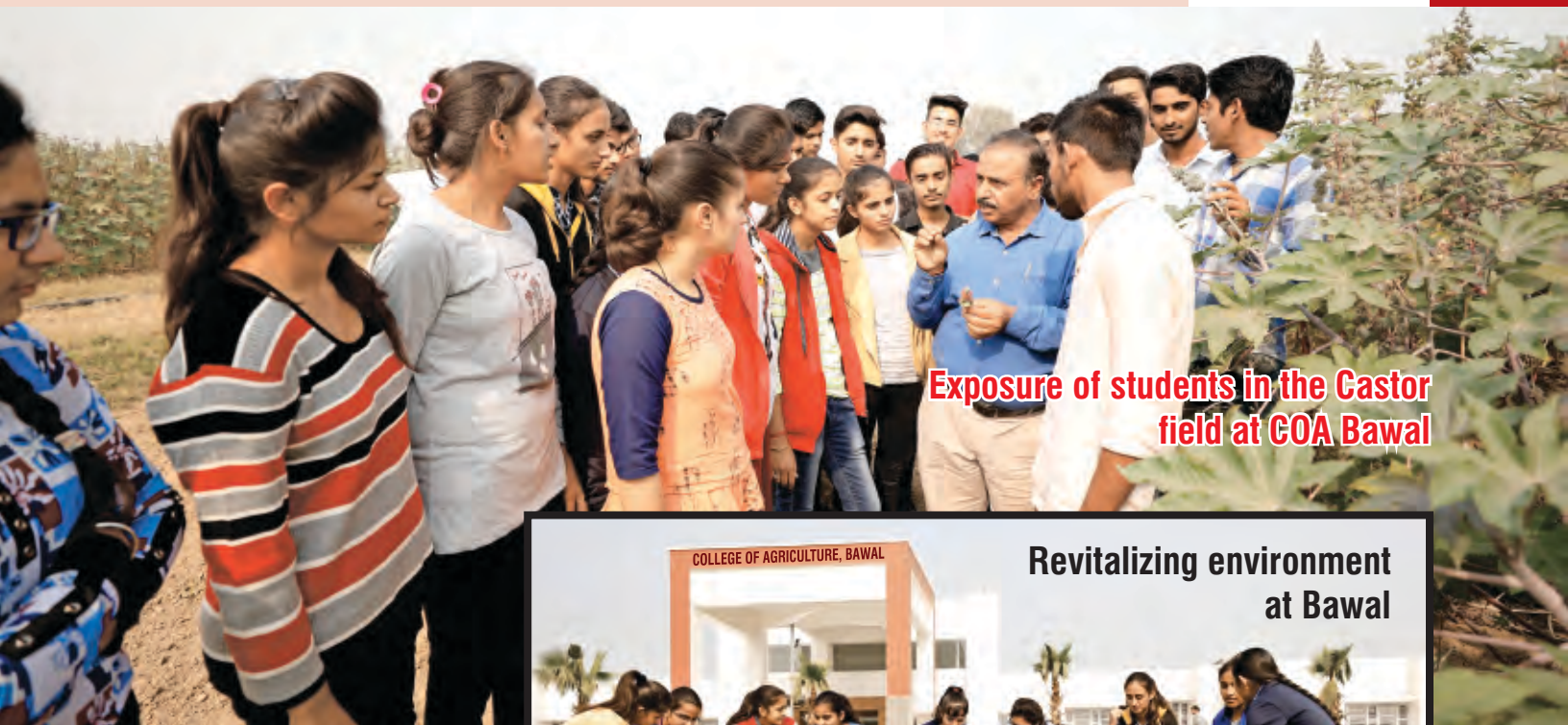
Exposure of students in the Castor field at COA Bawal