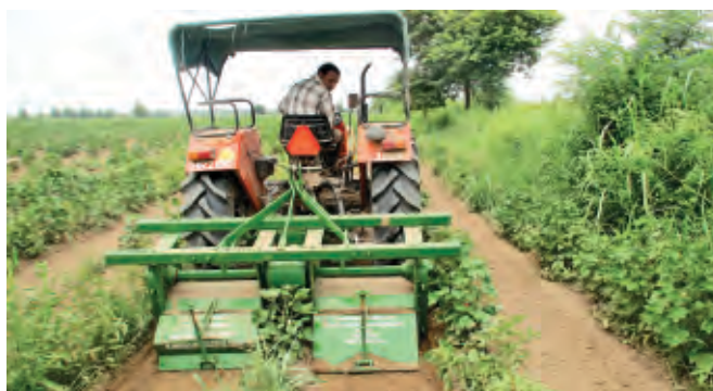
Tractor operated two row weeder being used in cotton field