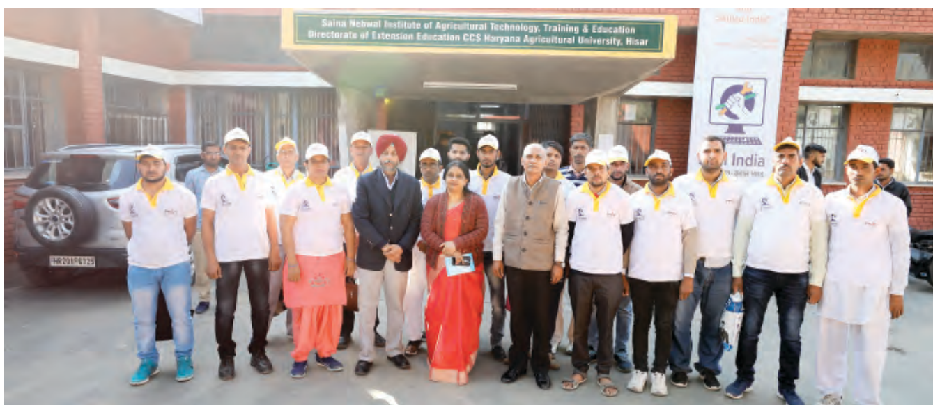
Skill Development Programme for Mushroom Growers Participants with Director, North Zone, ASCI of India and University Faculty

Rest of the points would belong to the general category.