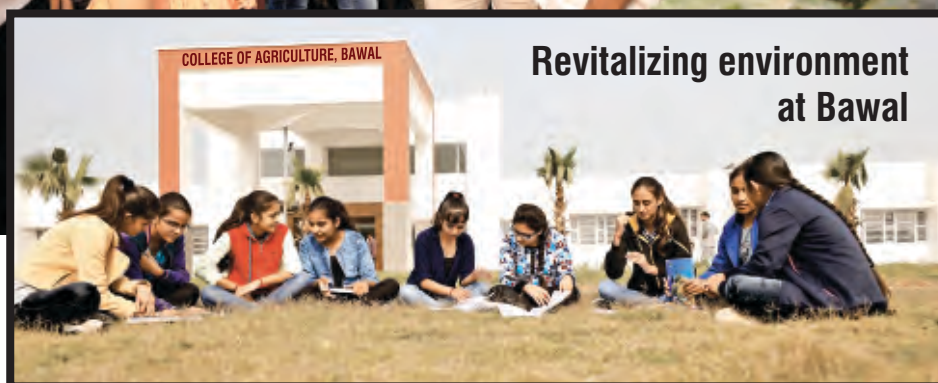
Revitalizing environment at Bawal