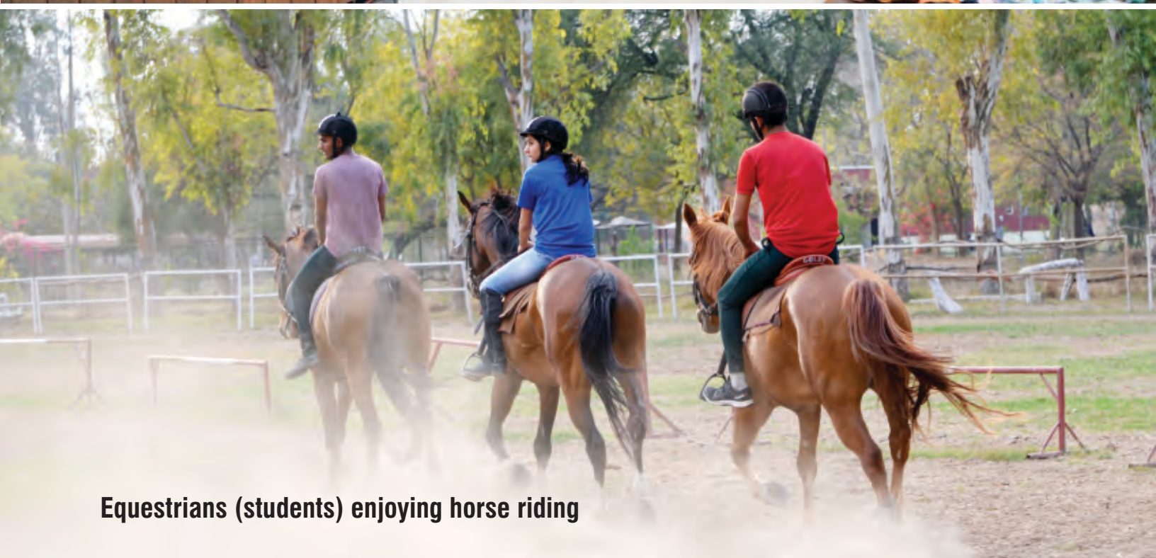
Equestrians (students) enjoying horse riding