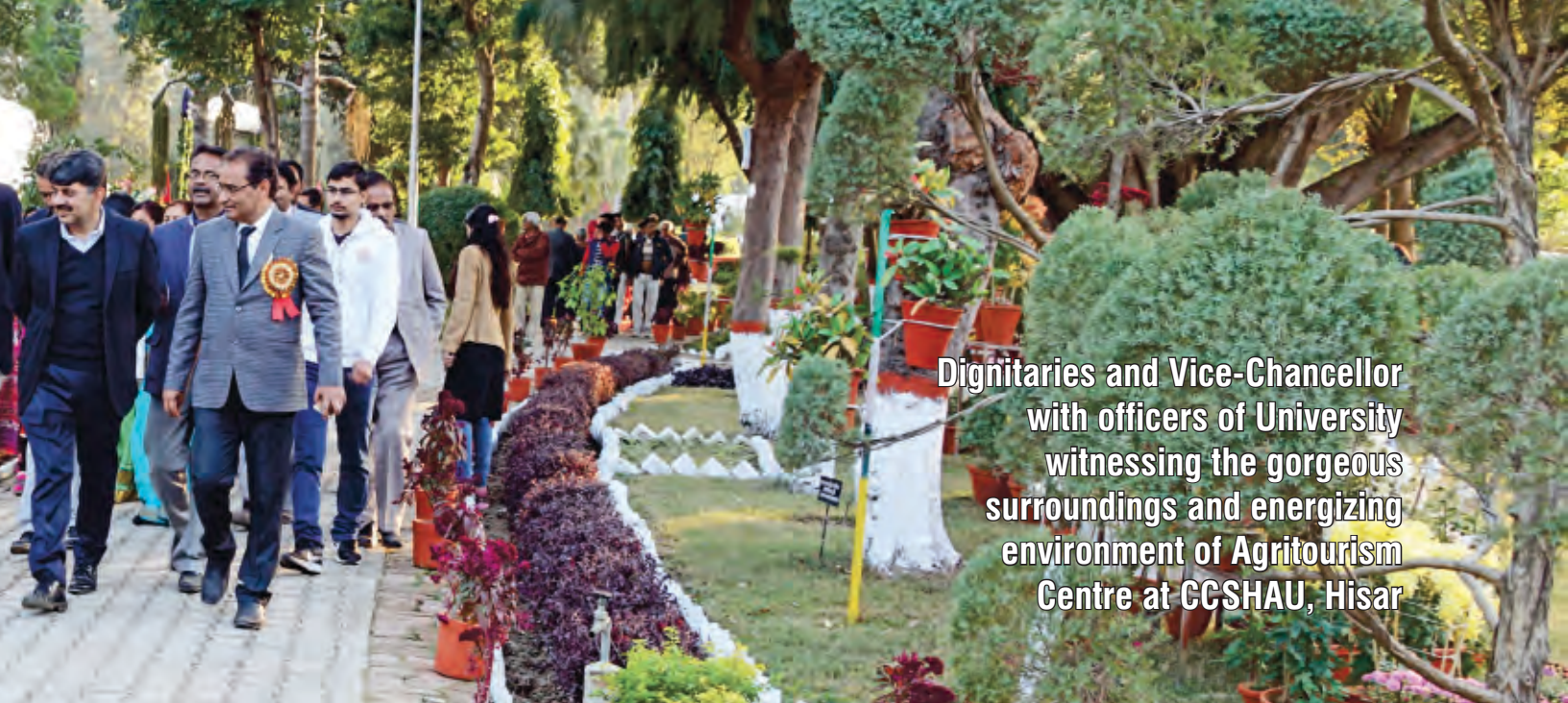
Dignitaries and Vice-Chancellor with officers of University witnessing the gorgeous surroundings and energizing environment of Agritourism Centre at CCSHAU, Hisar

stipend of the value of 6000/- per month provided they are not in receipt of any duty pay/monetary aid from any source except sports awards. A student enrolled for Ph.D. programme who has an OGPA of 7.5/10.0 basis or above or acquires later and maintain the same shall be awarded merit stipend of the value of Rs.10000/- per month provided they are not in receipt of any duty pay/monetary aid from any source except sports awards.