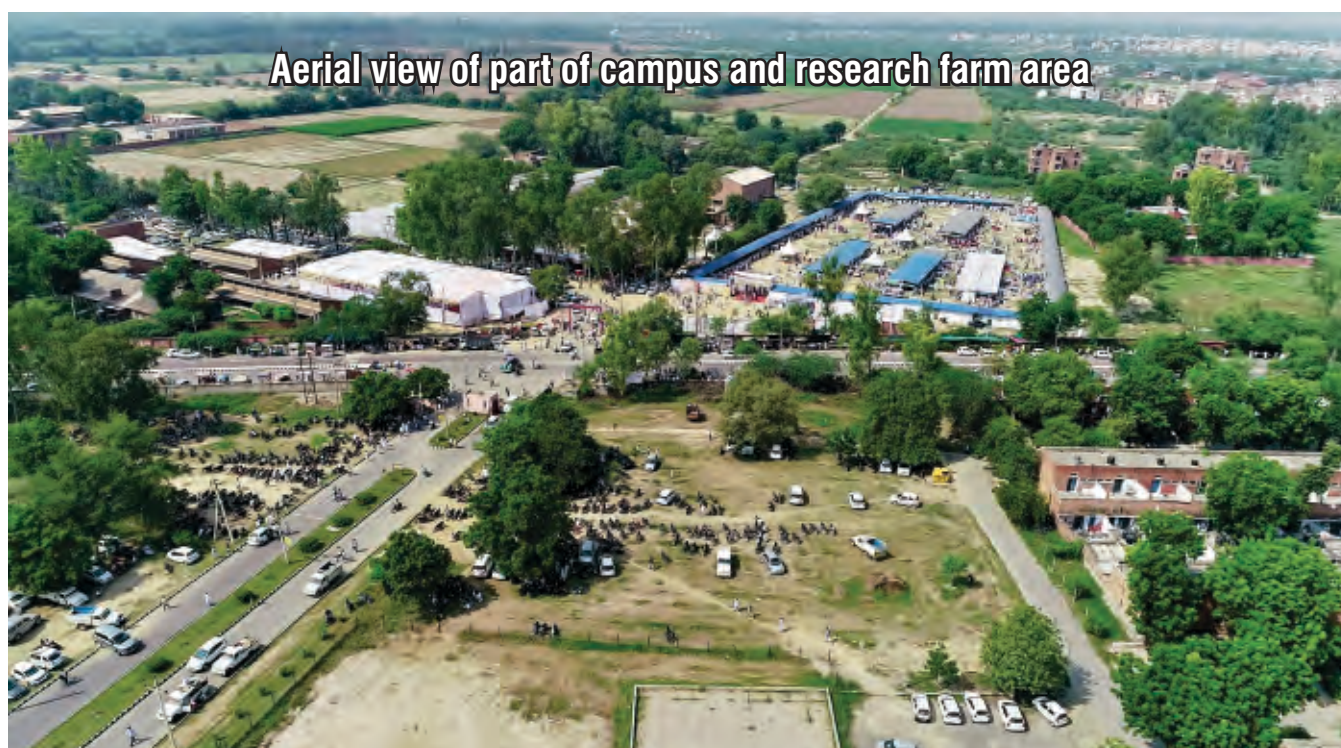
Aerial view of part of campus and research farm area

This post graduate course shall not only provide job avenues for students but also open a field of viable and effective interaction with national establishment related to various aspects of remote sensing. The main objective of this course is to develop multidimensional teaching in the field of remote sensing and GIS application in agriculture and environmental management.