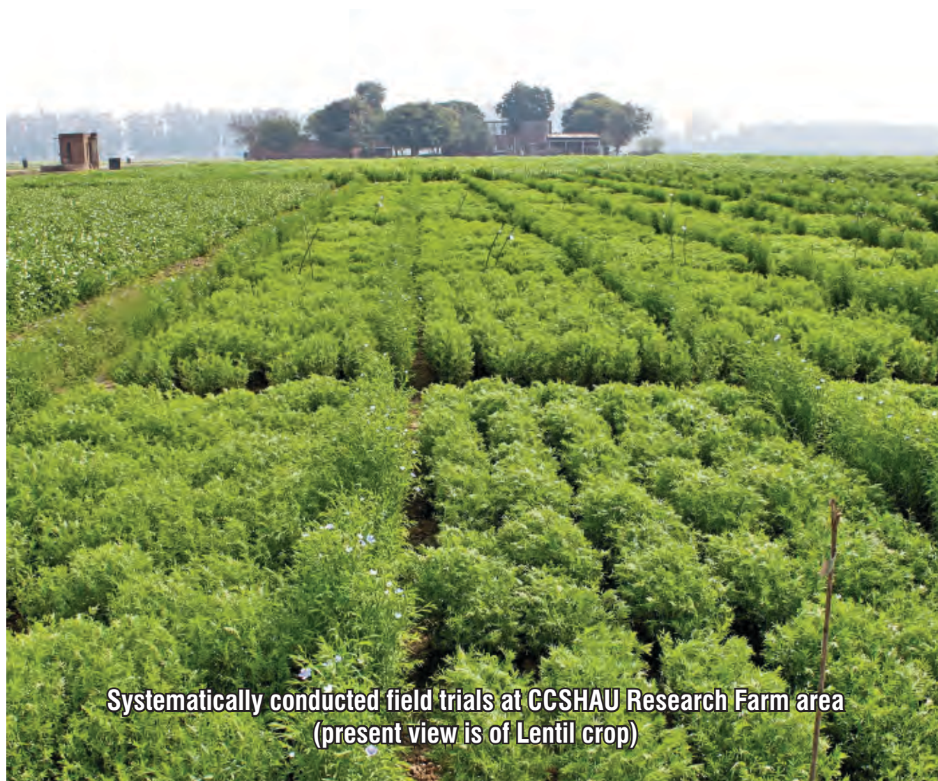
Systematically conducted field trials at CCSHAU Research Farm area (present view is of Lentil crop)

The main campus of the University is situated at Hisar at a distance of about 190 km North-West of Delhi on National Highway No. 9 and is 2.5 km from the Hisar Railway Station and 3 km from the Bus Stand. The University is spread over an area of 6095 acres at Hisar and 1418 acres at outstations. Area under farms at Hisar is 5359 acres and under buildings and roads is 736 acres. Since its existence, the University has been making rapid progress in building construction and has an excellent infrastructure. The University has one of the best developed campuses in India and fulfils academic and extra-curricular needs of the students.