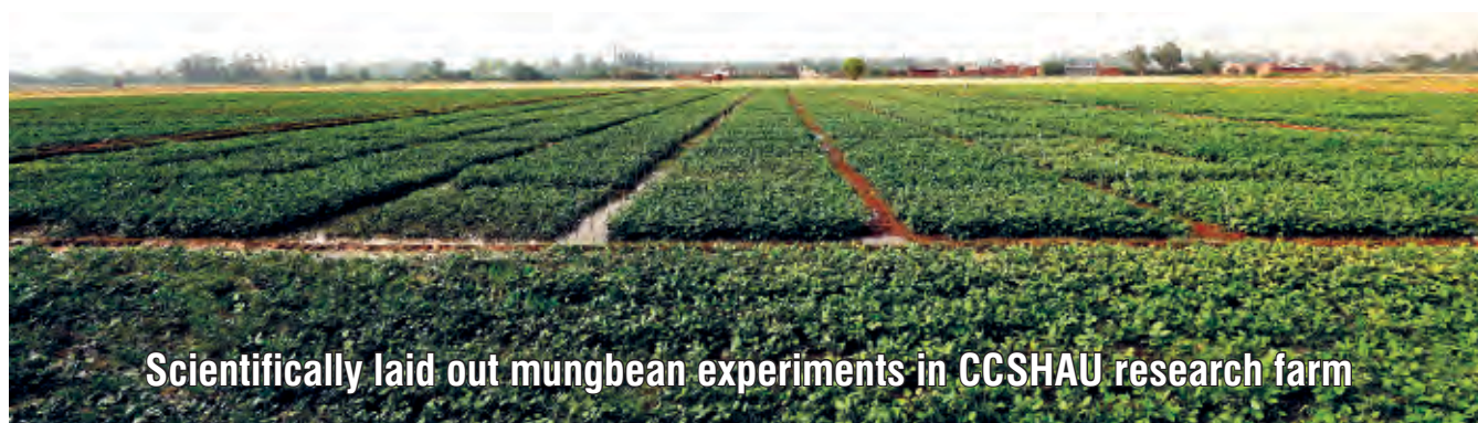
Scientifically laid out mungbean experiments in CCSHAU research farm