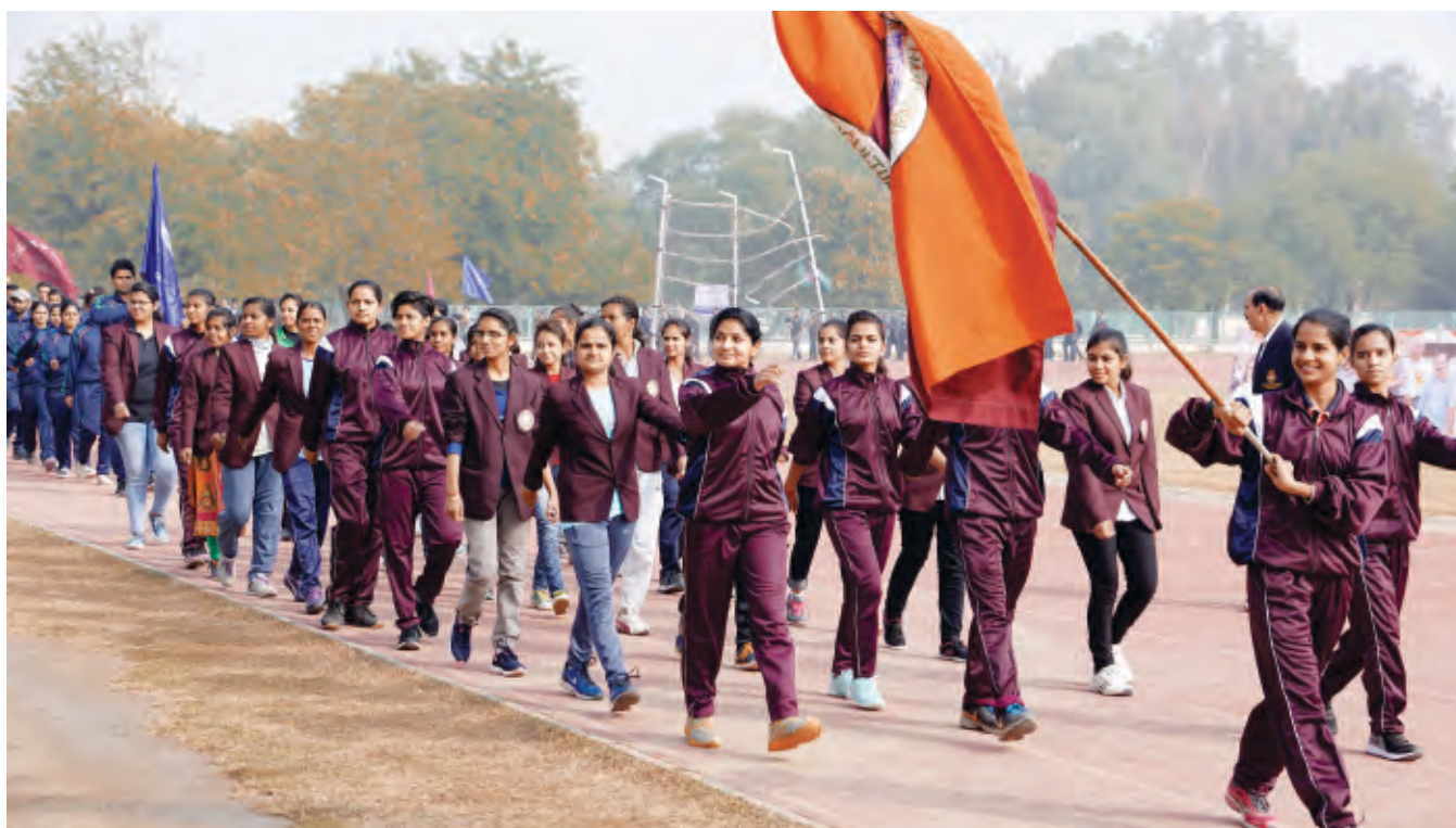
March-Past in the Athletic Meet