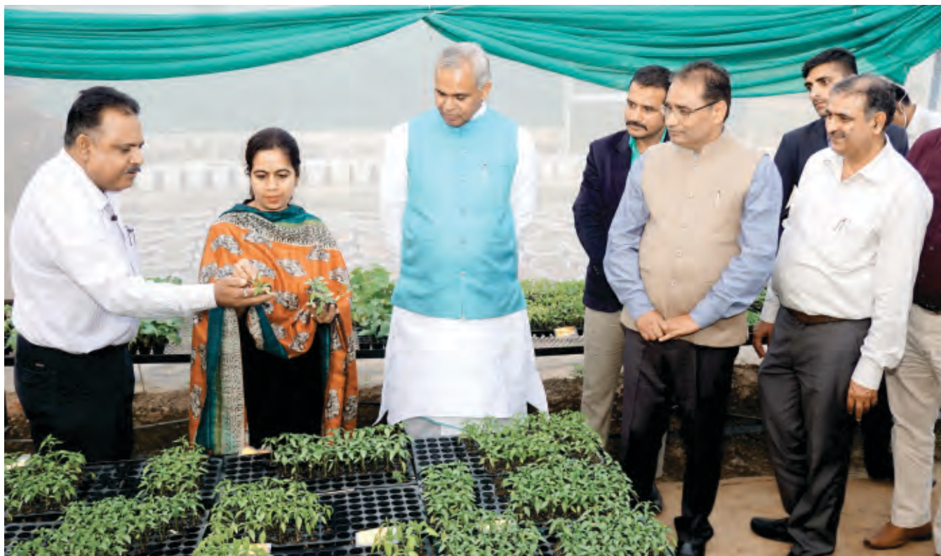
Acharya Devvart, Hon'ble Governor, Himachal Pradesh, visiting the Nursery to raise grafted seedlings of Tomato