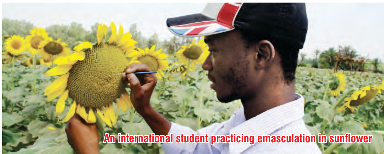
An international student practicing emasculation in sunflower