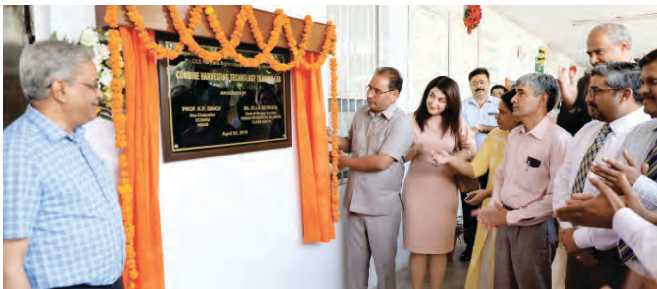
Inauguration of Combine Harvesting Technology Training Lab