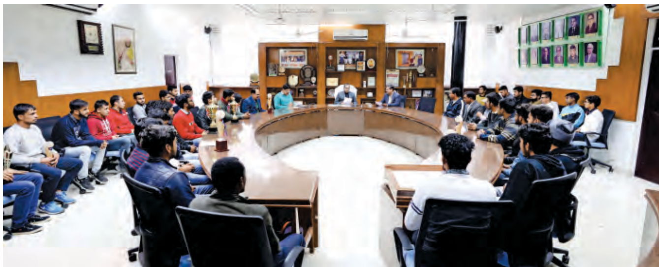
Award winning teams with Vice Chancellor, DSW and other Officials