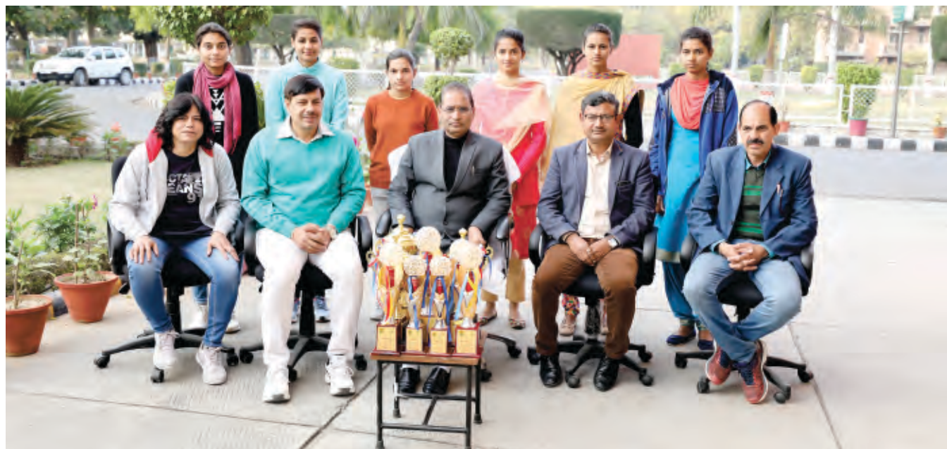
Award winners in Sports with Vice-Chancellor and other Officers

CCS Haryana Agricultural University, Hisar