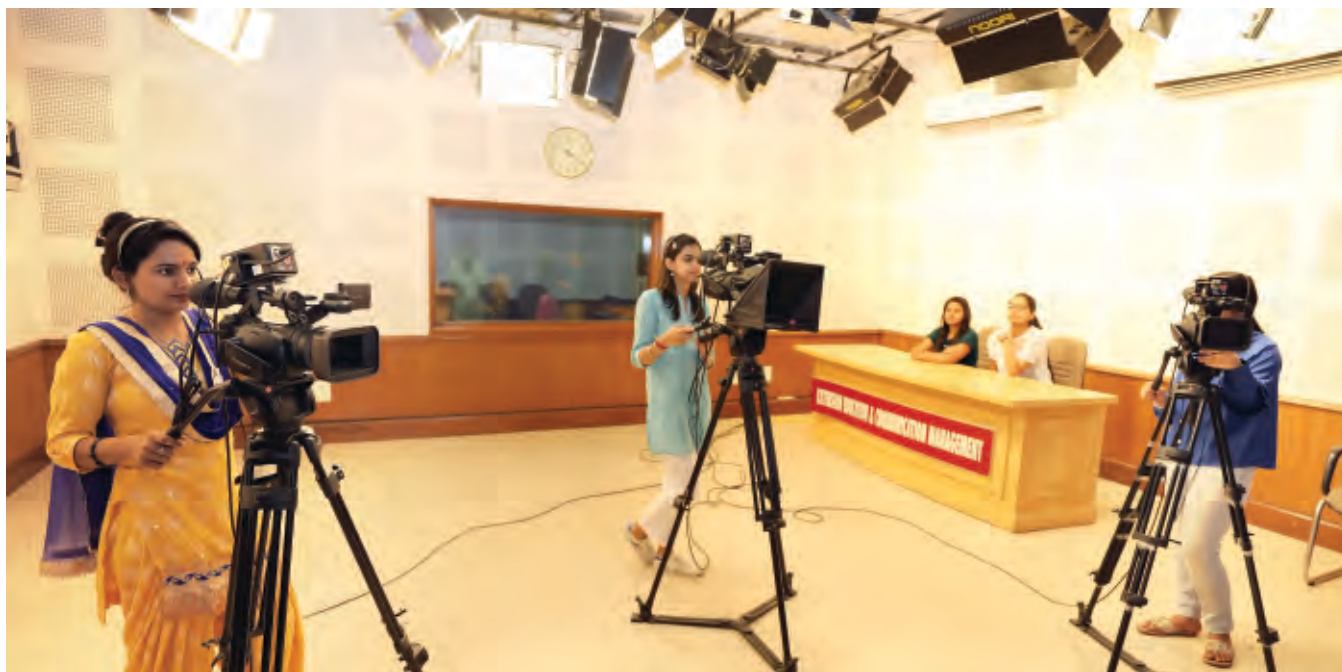
Full View and working of AV Lab of COHS