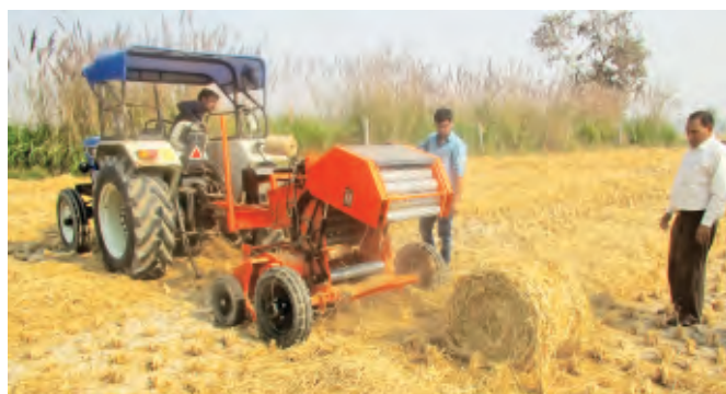
Tractor operated round baler being used for collecting paddy straw