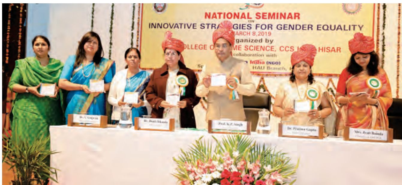
National Seminar on Gender Equality