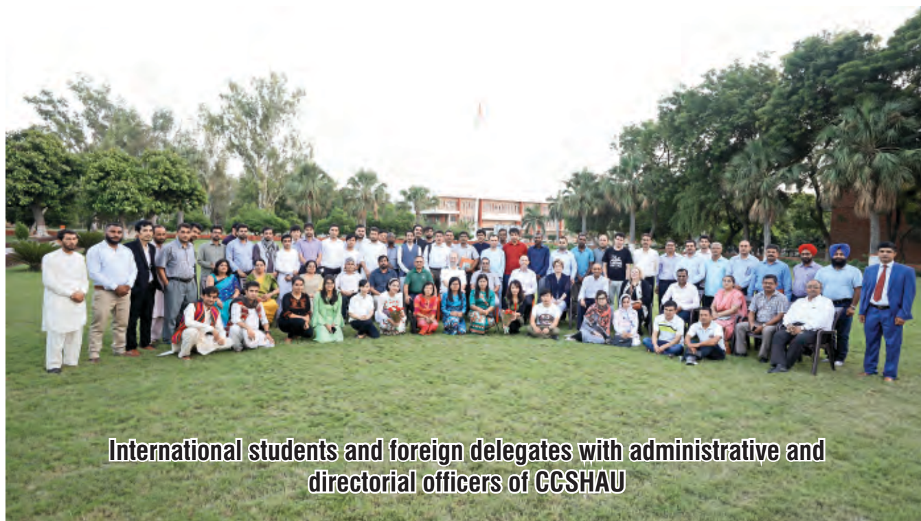
International students and foreign delegates with administrative and directorial officers of CCSHAU

Jurisdiction for all disputes shall be at Hisar.