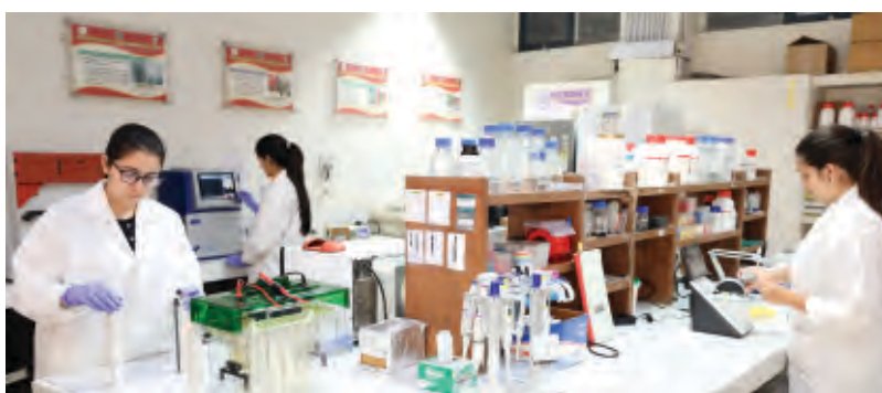
Students recording observations in the field (left) and working in the laboratory (right)