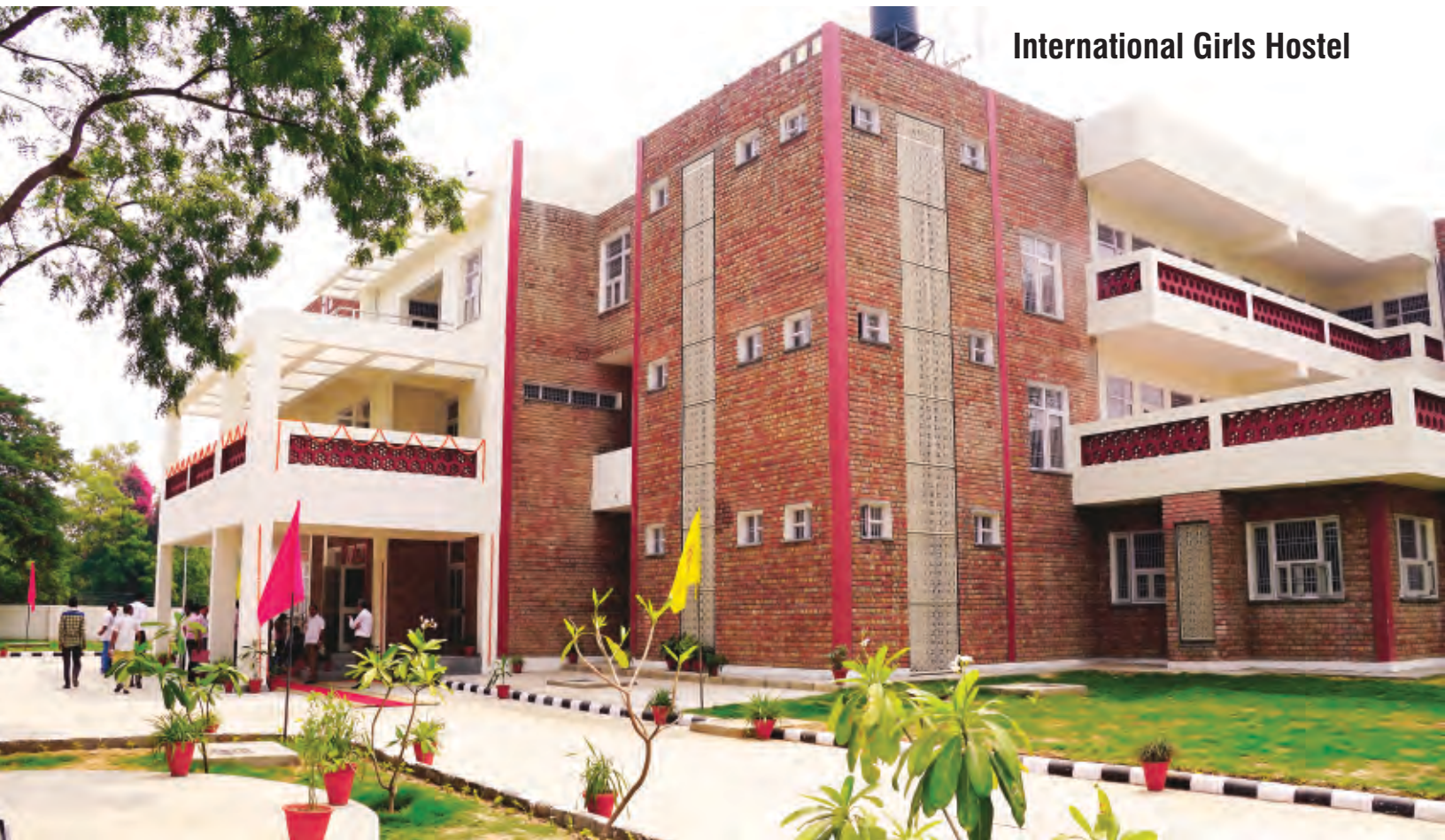
International Girls Hostel

system, gas connection, furniture, EPABX phone facility, water coolers with purifier system and Table Tennis facilities. Messes of hostels run on cooperative basis.